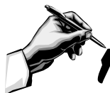
ILLUSTRATION: _____ _____