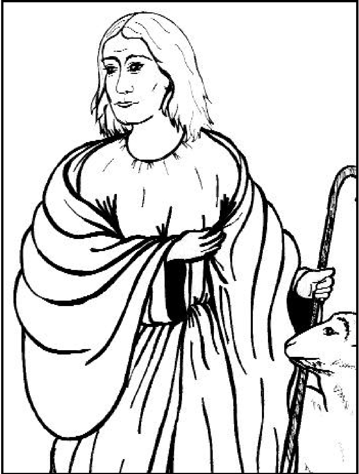
DAVID - THE SHEPHERD